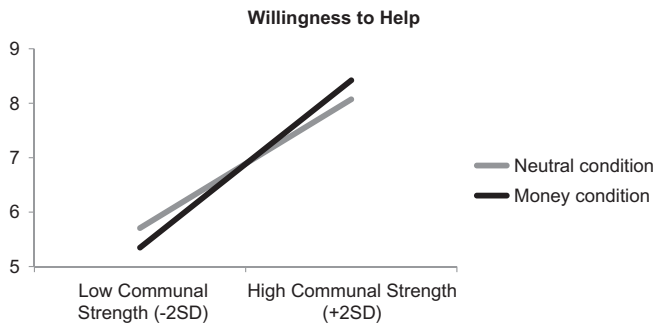
Figure 3. Mean willingness to help as a function of communal strength and condition (Experiment 4).

In contrast, when predicting how upset participants were by the requests for help, we saw two significant main effects, but no interaction. There was a positive main effect of money, indicating that money primes increased the extent to which people reported being upset with requests for help, B = .130 , t(250) = 2.082 , p = .038 , partial r = .131 . Further, there was a negative main effect of communal strength, indicating that more communal individuals were less upset by the requests, B = -.135 , t(250) = 2.160 , p = .032 , partial r = -.135 . The interaction was nonsignificant, B = -.074 , t(250) = 1.200 , p = .231 , partial r = -.076 , indicating that money primes increased negative reactions to the help requests similarly for individuals high or low on communal strength.