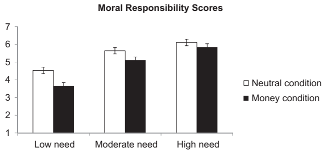
Figure 2. Mean moral responsibility to help as a function of level of need and condition (Experiment 2). Error bars represent standard error of the mean.