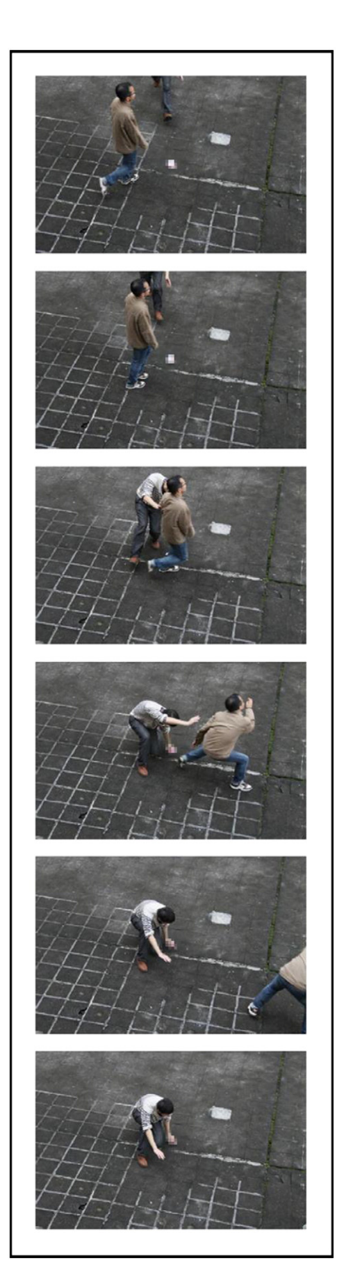
Fig. 2. Dynamic visual stimuli used in the pretest.

around \(\pm\)300. Also, 15.38% of participants responded "yes" to \(\pm\)50, whereas 80.77% participants said yes to \(\pm\)2000.