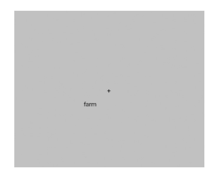
Fig. 1. Attention-control task stimuli. A fixation point was located in the center of the screen. Words were presented just below the fixation point and either to the left or right of the fixation point. Forty-six words were displayed per block for 4.5–7.5 seconds each. The total task time for each block was 4.6 minutes.

Our self-control manipulation used a common task that has been successfully used in prior depletion research (Schmeichel et al., 2003; Vohs & Faber, 2007). All participants were instructed to fix their attention on a small cross in the middle of a computer screen while words periodically appeared onscreen (Fig. 1). Participants in the attention demanding condition were told to ignore the words on the screen. If they found themselves attending to them, they were instructed to revert their eyes immediately back to the fixation cross. Participants in the